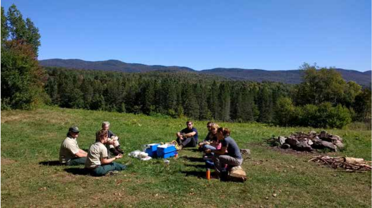
The second-year class enjoying lunch on a field trip to the Green Mountain National Forest

Historic Preservation Program Department of History • Wheeler House 133 South Prospect Street University of Vermont Burlington, Vermont 05405