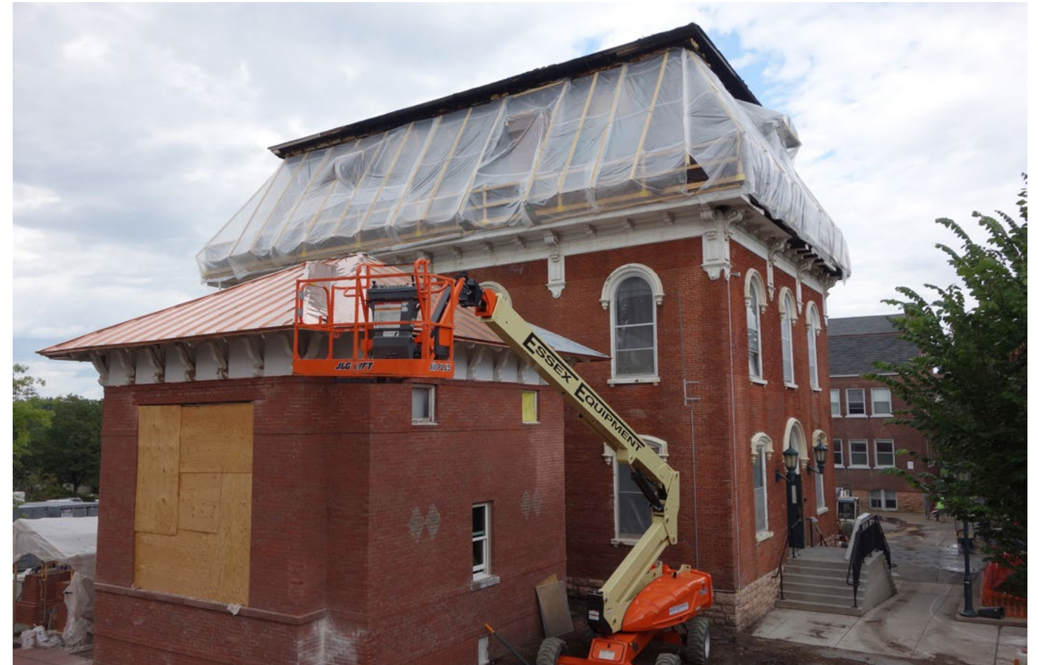
(Above) Torrey Hall stands under temporary stabilization after suffering severe damage from a fire that started during renovations to this historic campus building.