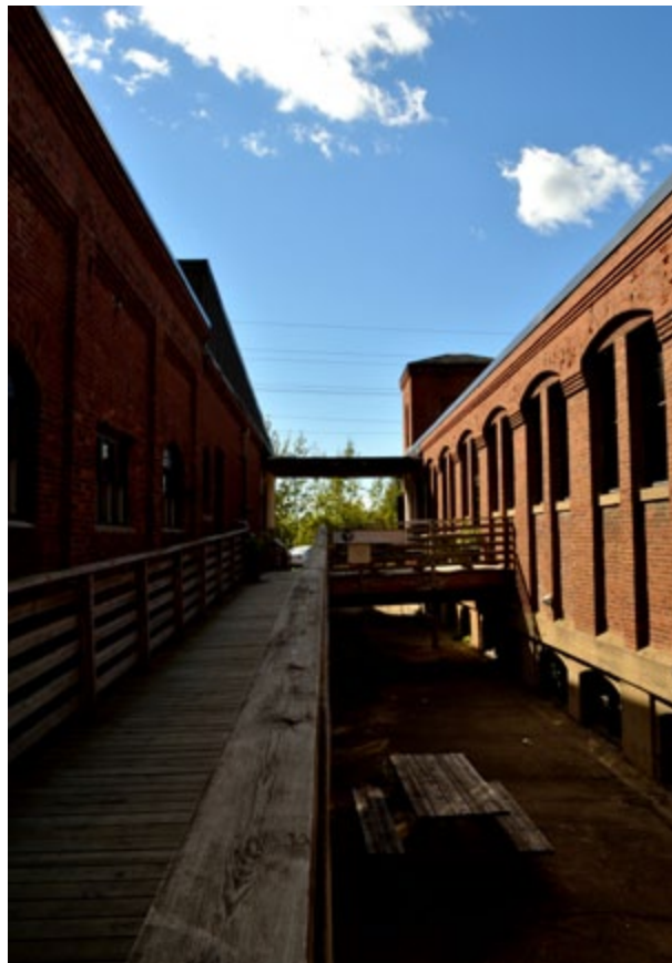
Vermont Milk Chocolate Company.