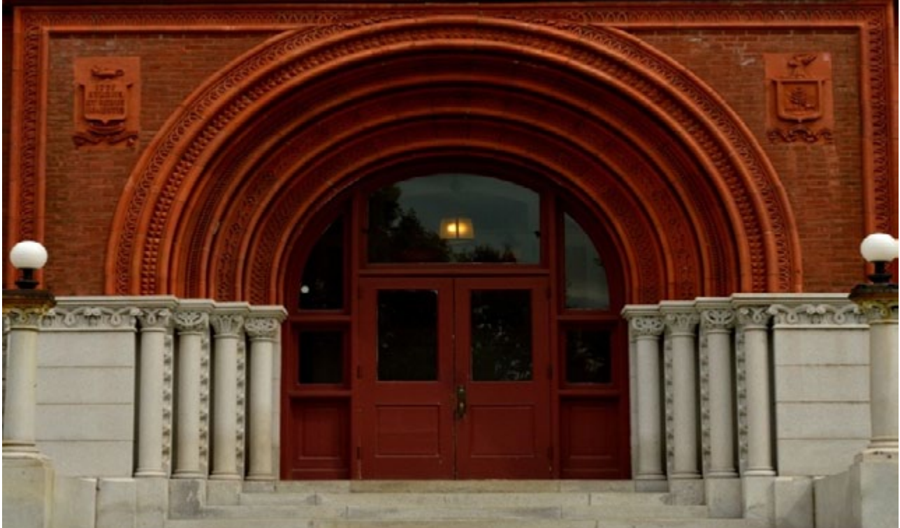
Resting upon a granite base with engaged colonnettes, the Syrian archway surrounding the front entrance of Williams Hall at the University of Vermont is clad in unglazed terracotta tiles.