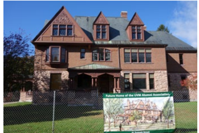
The future home of the UVM Alumni Association at 61 Summit Street on the University of Vermont campus