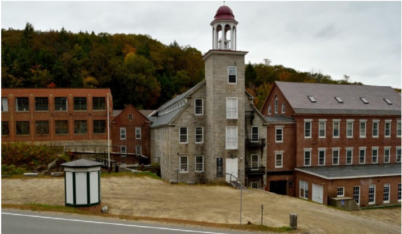
The historic mills in Harrisville, New Hampshire reflect the town's manufacturing and industrial history.