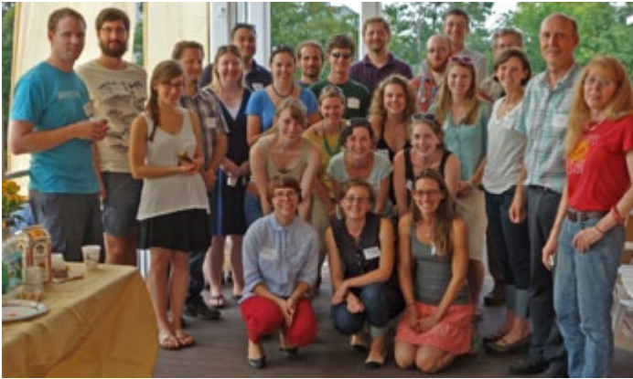
Incoming students in the Historic Preservation Program were welcomed with a reception held on the west veranda of Wheeler House at the start of the fall 2013 semester. UVM Historic Preservation Program alumni also attended the annual event.