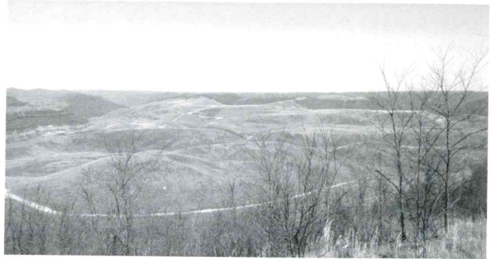
The results of Mountaintop Removal Mining. These hills were once twice as high and their contours bear no relation to their original form.

high degree of integrity. However, coal mining continues in southern West Virginia and the battlefield faces threats from the encroachment of mountaintop removal mining. Should mountaintop removal mining take place