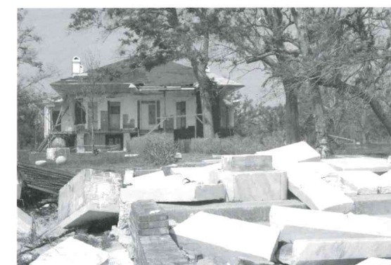
Beauvoir, the NHL home of Jefferson Davis, suffered substantial damage during Hurricane Katrina.

Because of the large scale of damage hurricanes leave behind, the recovery work is split into many different pieces that can be accomplished in steps. Ciampolillo has spent the last two years assembling a draft of the historic context of one of the seven gulf counties in Mississippi, compiling a statement of the historic significance of the many historic resources in the