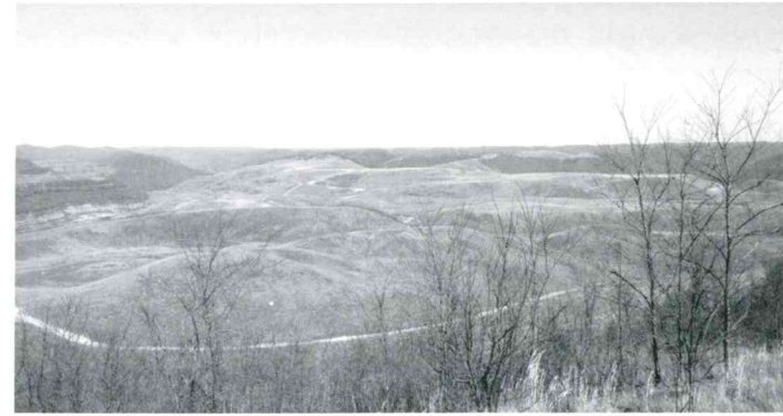
The results of Mountaintop Removal Mining. These hills were once twice as high and their contours bear no relation to their original form.

high degree of integrity. However, coal mining continues in southern West Virginia and the battlefield faces threats from the encroachment of mountaintop removal mining. Should mountaintop removal mining take place