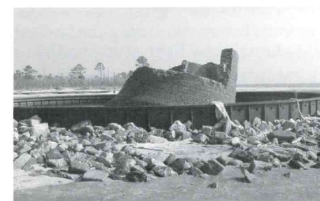
The remains of Round Island Lighthouse, off the coast of Pascagoula, Mississippi, after Hurricane Katrina.