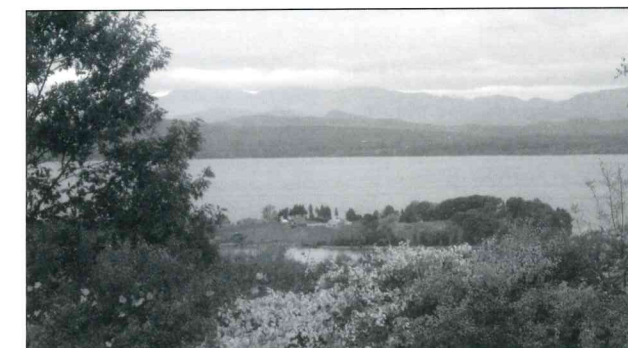
Vernacular landscape, Shelburne, Vermont.

"organically evolved landscape," also referred to as a vernacular landscape. This includes townscapes, farmland or other areas that continue to be used and changed over time; 3) An associative (or ethnographic) landscape, which has strong religious or cultural ties and includes important Native American sites.