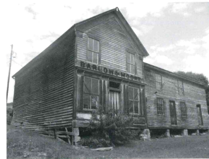
Barlow & Moore General Store, Pocahontas County West Virginia. Site Visit where the owner wanted to discuss a potential National Register Nomination and Restoration Techniques. The owner was especially concerned about restoring versus replacing the historic windows.

to replace them with new vinyl units. I mention this one example because it accurately reflects the issue of restoration versus replacement. It was a theme in almost every single site visit with homeowners, city council members and the general public. They continually expressed their concern over the cost of restoring original materials rather than just replacing them.