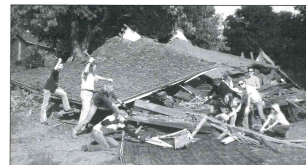
The class on a recent field trip.