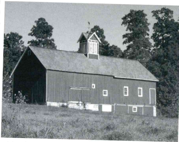
A bank barn with a wooden ventilator in Manchester, Vermont.

If interested in participating in the Vermont Barn Census, a project run by the State of Vermont Division for Historic Preservation, please visit www.uvm.edu/~barn for more details.