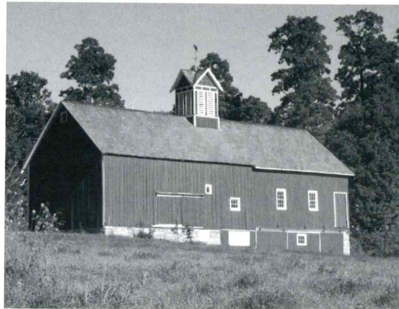
A bank barn with a wooden ventilator in Manchester, Vermont.

In addition to submitting this documentation to