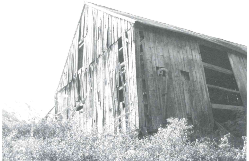
One of the barns surveyed for the Vermont Barn Census in Grafton, VT.