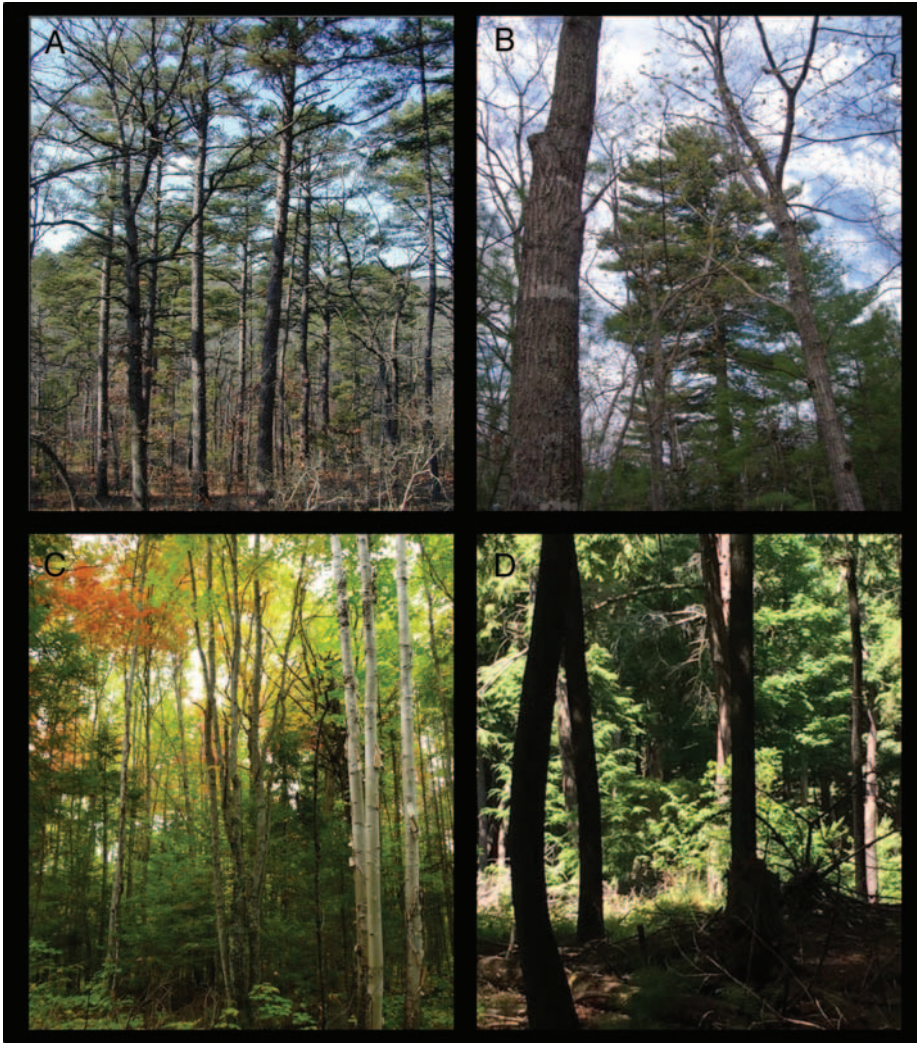
Figure 1. Examples of mixedwood types in eastern North America. A. Shortleaf pine-oak forest in southern Missouri. B. White pine-red oak forest in southern Maine C. Spruce-fir-hardwood forest in Quebec D. Hemlock-hardwood forest in northern Wisconsin Descriptions of associated species and common site types are provided in Table 1.

gle-species stands, resulting in greater productivity in mixed stands than in monocultures of any of the constituent species (Kelty et al. 1992, Pretzsch 2014). Commonly referred to as “overyielding,” this phenomenon has been reported in spruce-beech ( Picea-Fagus ) mixtures in Europe (Pretzsch and Schütze 2009) and pine-oak mixtures in the northeastern United States (Waskiewicz et al. 2013). The potential for increased carbon storage in mixedwood stands suggests that these forests may be inherently favorable for climate change mitigation, although this generality has yet to be explored empirically.