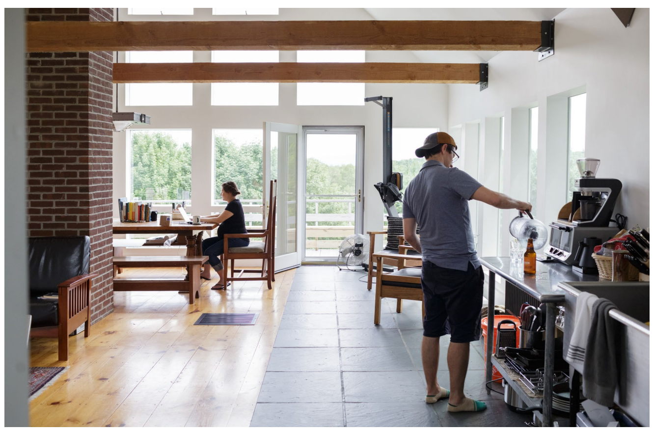
Justin makes lunch while Elise finishes a training session with an organization in Africa. Their home has an open-floor plan featuring no closets and lots of windows.