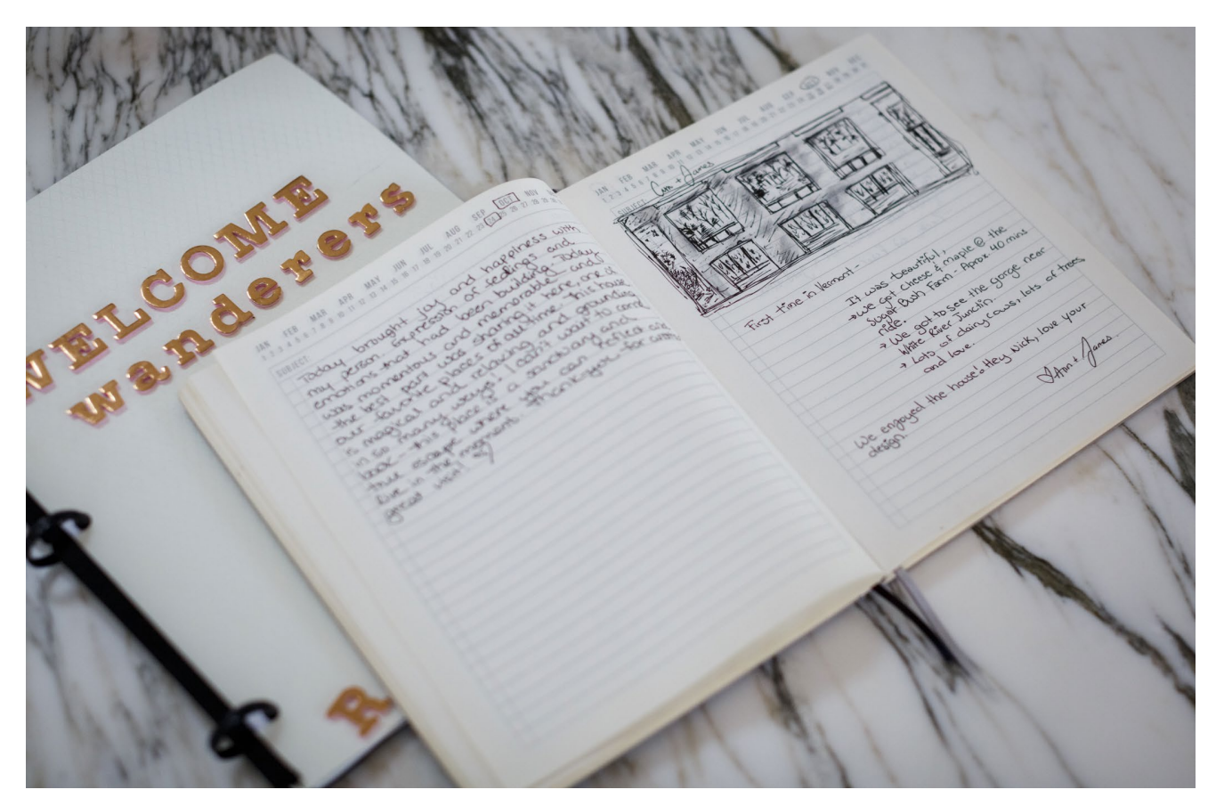
Airbnb guests have surprised Justin and Elise by leaving poems, drawings, maps, and long notes in their guest book in a show of gratitude for the space and its access to rural Vermont.