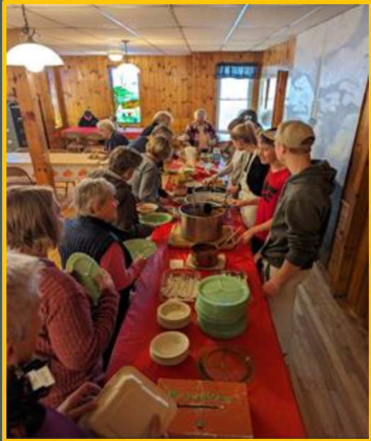
Recipe for Connection, Hazen HS 11/23 at Hardwick United Church