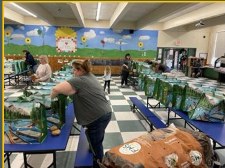
Vergennes Elementary students participating in food systems learning via the CS garden, food delivery, & volunteering at the local food pantry.