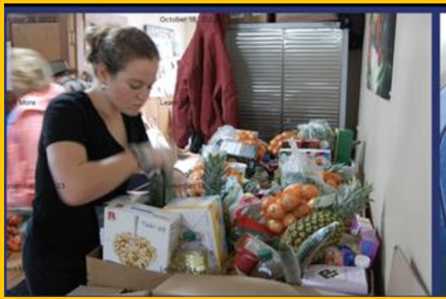
Cabot Senior X, Danville Health Center