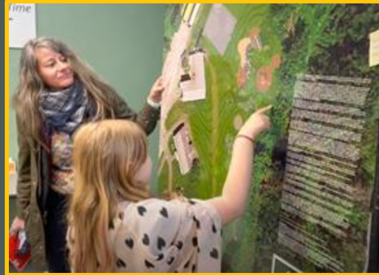
Cabot ES playground advocacy