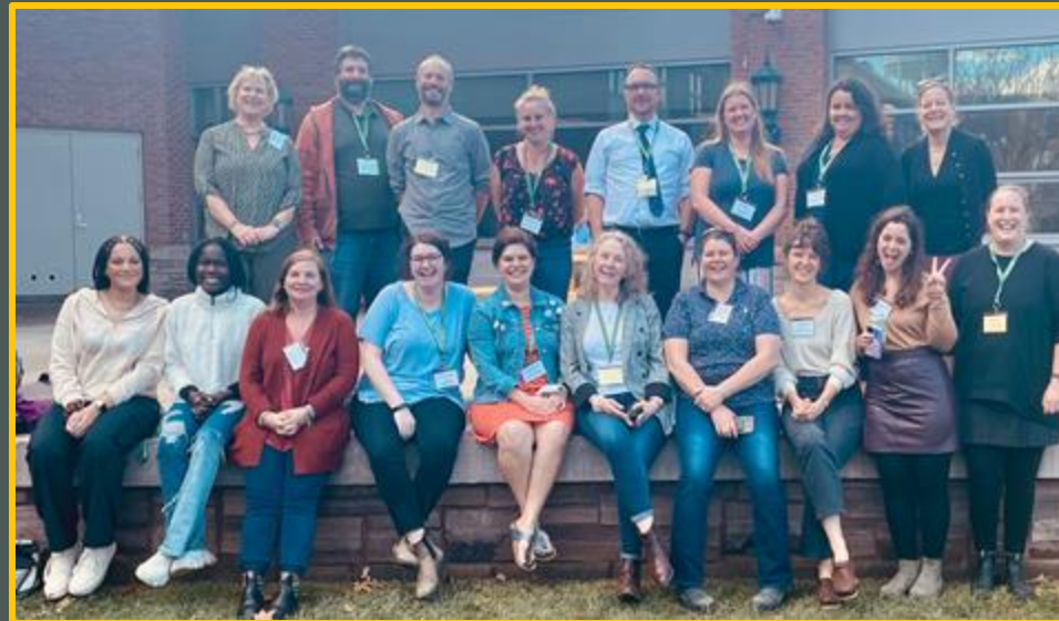
Reading to Raise Anti-Racists, 2022-2023 - Ferrisburgh & Vergennes Union Elementary Schools