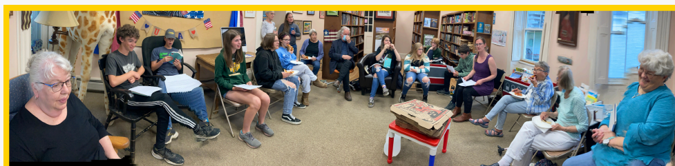
White River Valley Middle School students participate in community-wide reads with elders from the local community.