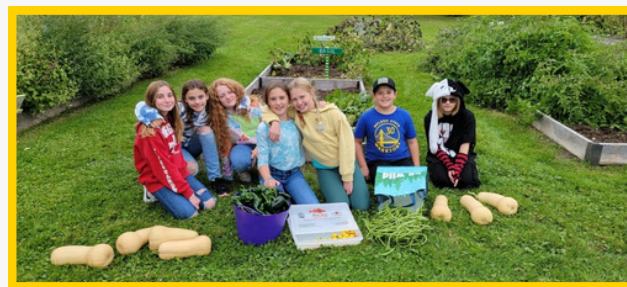
Students at Vergennes Union Elementary preparing fresh produce for weekend backpack program & community food bank donations.

VT Community Schools funding and partnerships provided services to students that may have not been eligible for federal social safety net programs, based on definitions and criteria, enhancing overall health and wellness of students, families, and communities.