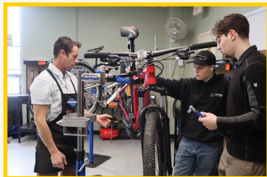
Students at Hazen Union School learning bicycle maintenance and mechanics in partnership with local business and Lamoille Valley Rail Trail.