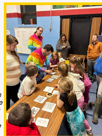
Early Childhood Education students and families in the North Country Supervisory Union participate in the NCSU 'Art Van-Go' mobile arts lab.