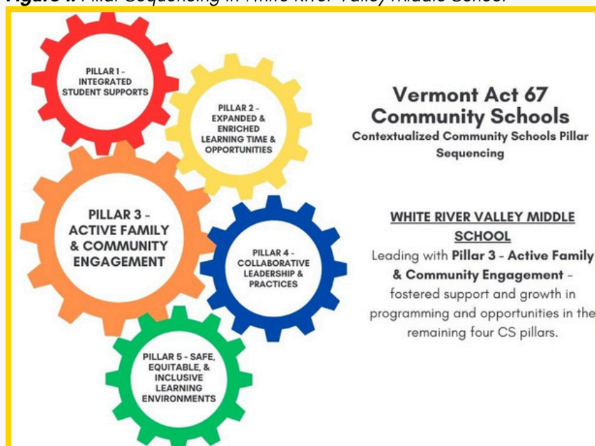
Figure 1. Pillar Sequencing in White River Valley Middle School

Lastly, the way this grant program was built and managed by the VT AOE intentionally created opportunities for connection, collaboration, and social capital development across the state. This purposeful development of a Community of Practice helped to counteract the isolation many school leaders experience, providing a collegial and supportive network where school leaders and State Education Agency, and University partners could connect and learn from one another.