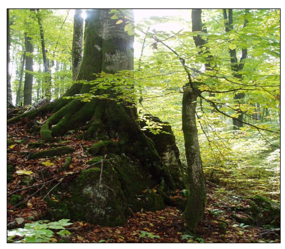
Final Report July 1, 2008