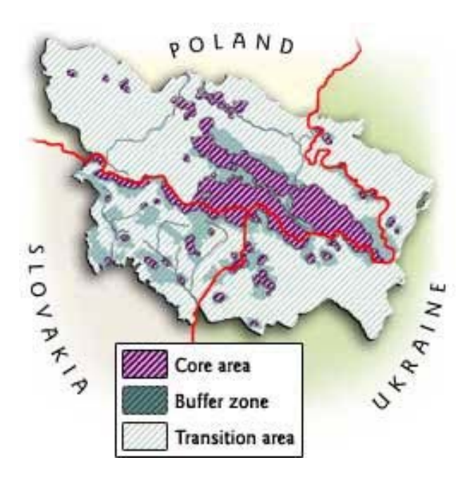
Figure 2. Map of the East Carpathian Biosphere Reserve.

East Carpathian Biosphere Reserve (ECBR). Protection of biodiversity on a landscape level, irrespective of borders was a primary objective underlying the initial design and creation of ECBR, the first tri-lateral biosphere reserve in the world (Fig. 2). In May 1990, a proposal to establish a trilateral biosphere reserve in the Eastern Carpathians on the border of Poland, Slovakia, and Ukraine was presented at UNESCO's MaB Programme meeting in Kiev, Ukriane.