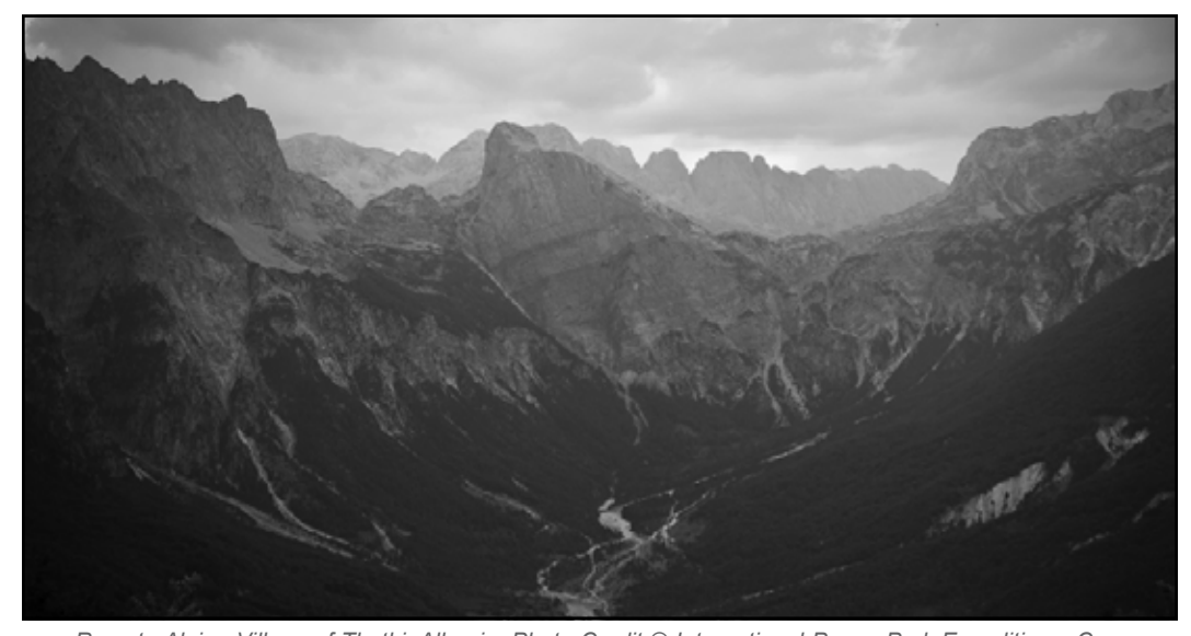
Remote Alpine Village of Thethi, Albania. Photo Credit © International Peace Park Expeditions, Cory Wilson, 2009.

This case study tells the story of the proposed Balkans Peace Park and its genesis and evolution as it progresses from an idea into reality, aspiring towards official Track 1 recognition.