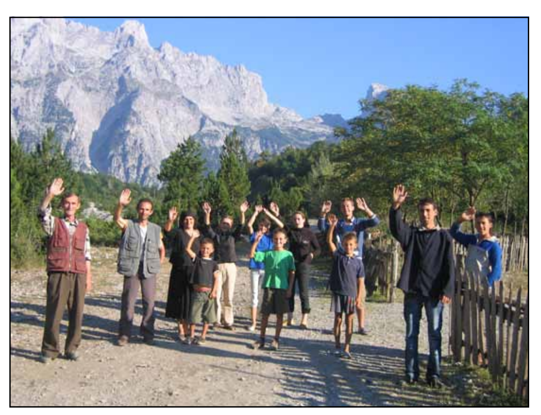
Photo Credit: IPPE / Todd Walters 2008. The Harusha Family in the high alpine mountain village of Thethi, Albania demonstrate traditional hospitality by walking the guest out the gate of their property.

Even though the Balkans Peace Park remains a proposed park, steps towards formally establishing the park continue to be taken, and cross-border connections continue to be built and strengthened, while stakeholders prepare for the proper moment to apply pressure at the national levels for the formal creation and dedication of the Balkans Peace Park. Lessons from the Balkans can serve others involved in transboundary conservation efforts around the world, allowing them to learn from, adapt, and apply these lessons in their own local context. And of course, the Balkans Peace Park Project (B3P) continues to scour the literature from Peace Studies, Environmental Studies, Borderlands, Anthropology, and other disciplines, in order to apply lessons learned elsewhere in Albania, Kosovo and Montenegro, and make the dream of that formal declaration a reality.